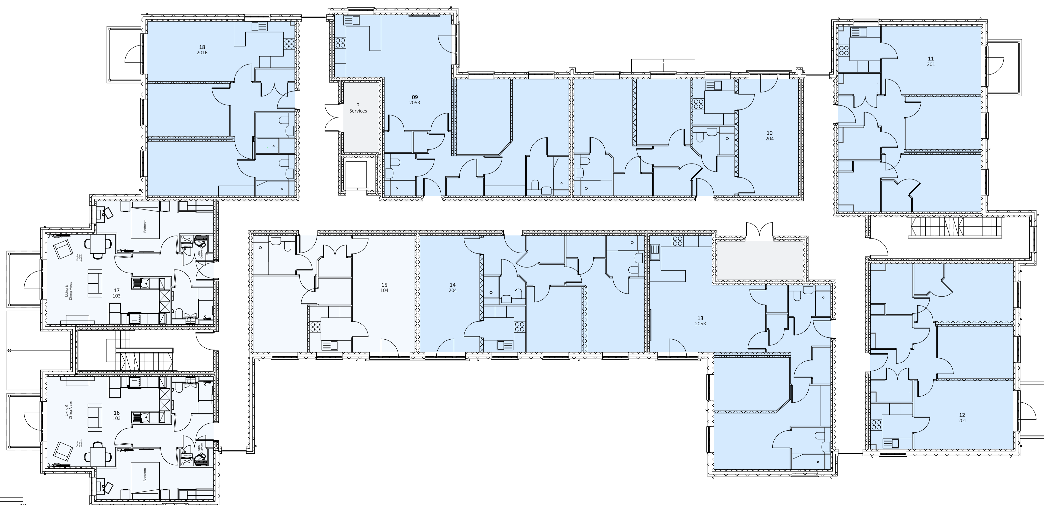
FIRST FLOOR L2